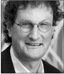
National councillor Geri Müller.

Interview with National councillor Geri Müller